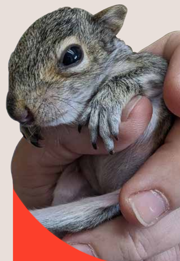
A three-week-old Eastern Gray Squirrel opened his eyes for the first time on April 8, 2023, at the Humane Indiana Wildlife and Rehabilitation Center; after being blown out of a tree during a storm the week before.

Or a gift of $75 will support the costs of formula for two litters of opossums or squirrels or four litters of eastern cottontails.